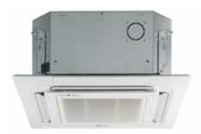
Multi F Ceiling Cassette Indoor Units